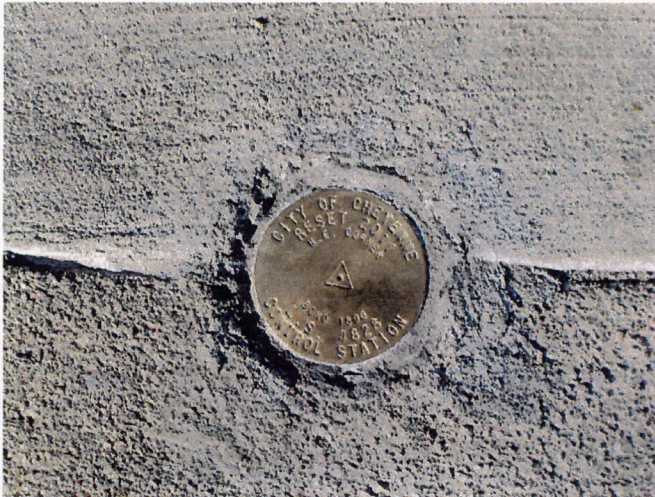
Figure 1 - Reset Brass Cap.